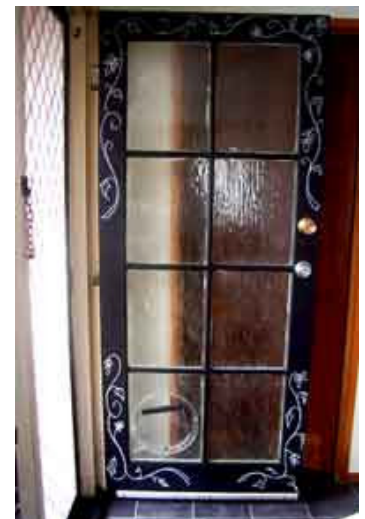
We hope to see you soon through our new front door!