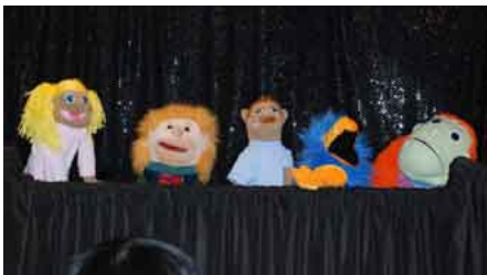
The cast of the family service.

Last month, the team also produced a dramatic show called "The Gospel (According