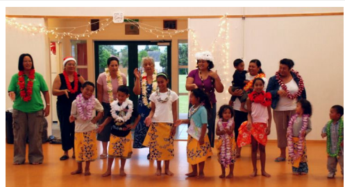
A bright and colourful Niuean item from Malama's family.

Our Christmas tradition would hardly be complete without a shared meal together. Approximately 75 people, including a number of neighbours and extended family, gathered on Christmas Eve for an enjoyable time of carolling, story-telling, musical items, and of course food. Through this, we're praying that WCF's presence in the community will continue to be promoted.