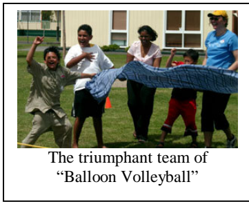
The triumphant team of "Balloon Volleyball"

We have continued to look for ways to connect with the many in our community who are disillusioned with Christianity and avoid church. On November 25, we provided a community event for parents and kids to have fun, relax and get to know others (complete with bouncy castle, ice cream and espresso trucks, water balloon toss, tug-o-war, as well as ways for them to find out more about who we are). Although the turnout was less than we had hoped for (around 50), some really good things came out of it. Nearly the whole church turned up to help out. We learned some important things so that the next event will be more effective. One local pastor that attended encouraged our group, "Your church did a great job. Just keep at it. It takes time"