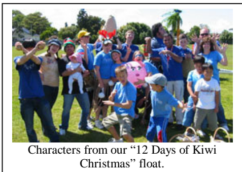
Characters from our "12 Days of Kiwi Christmas" float.